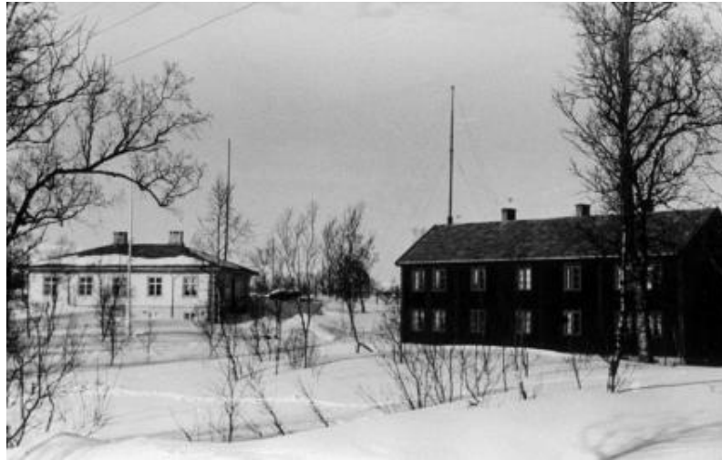
Pic. 1: The Auroral Observatory in Tromsø in 1955. The left building was the observatory building, while the right building was the living quarters for the staff.

TGO's main purpose is to maintain long-term observations of geophysical processes in the ionosphere/upper atmosphere above Tromsø and in general in Norway.